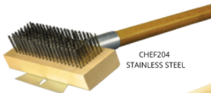
CHEF204 STAINLESS STEEL