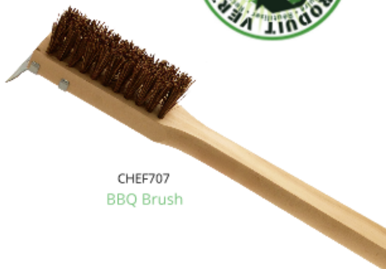
CHEF707 BBQ Brush