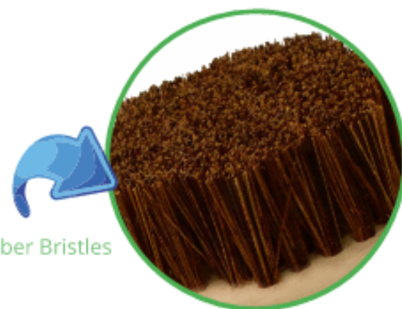
Natural Fiber Bristles