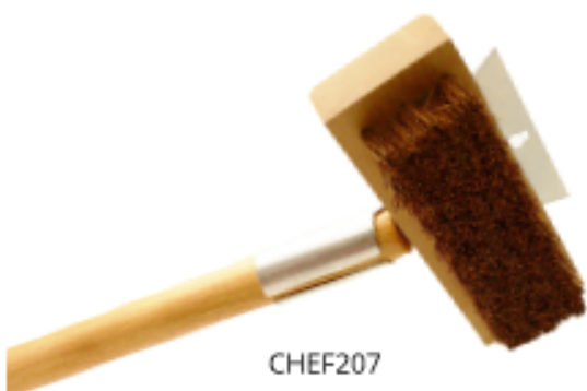
CHEF207 Grill and Oven Brush