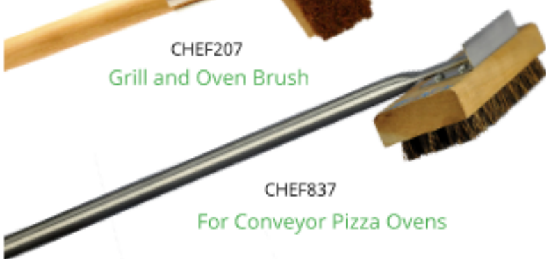
CHEF837 For Conveyor Pizza Ovens