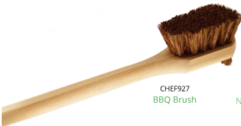
CHEF927 BBQ Brush