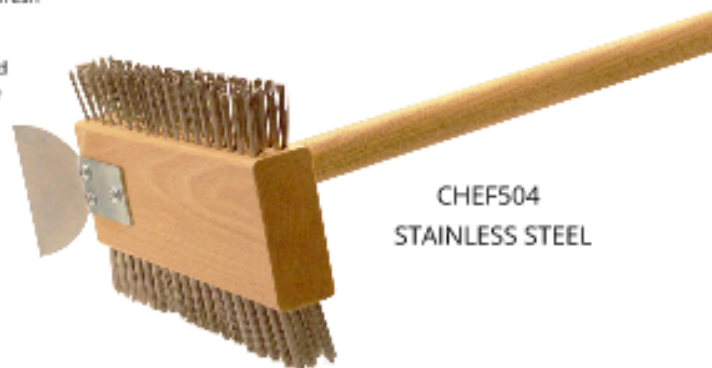
CHEF504 STAINLESS STEEL

Two different fill densities allow for flexibility in cleaning applications.