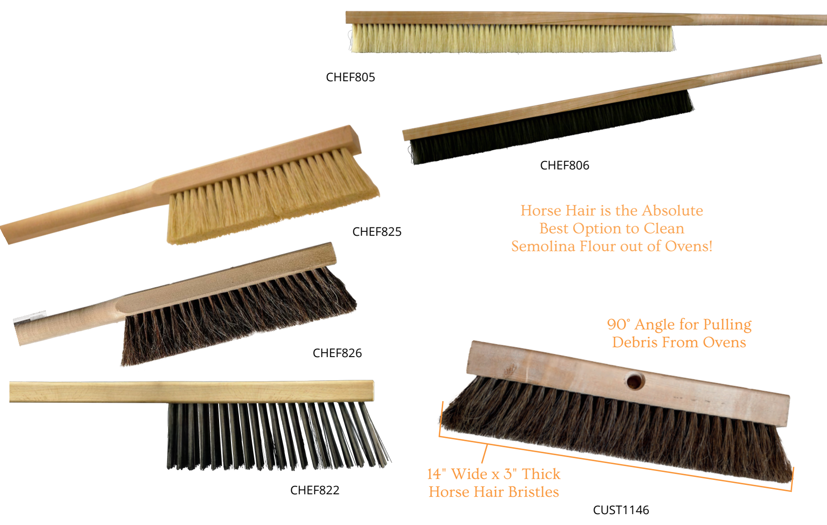
Purchase with handle #60118

High Quality Pizza Brooms and Oven Brushes